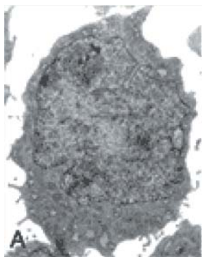
A: Cancer cell before treatment

Consuming enzymes found in package 6 will rid the body of the dead cancer cells by turning them into energy and feeding the body. The waste that the body will not be able to recycle will go through the natural process of elimination.